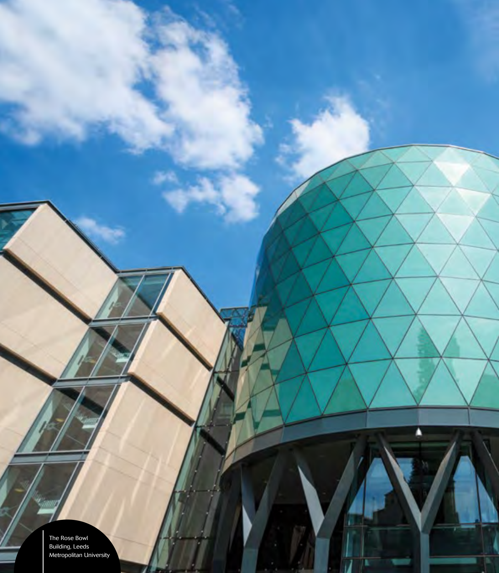
The Rose Bowl Building, Leeds Metropolitan University