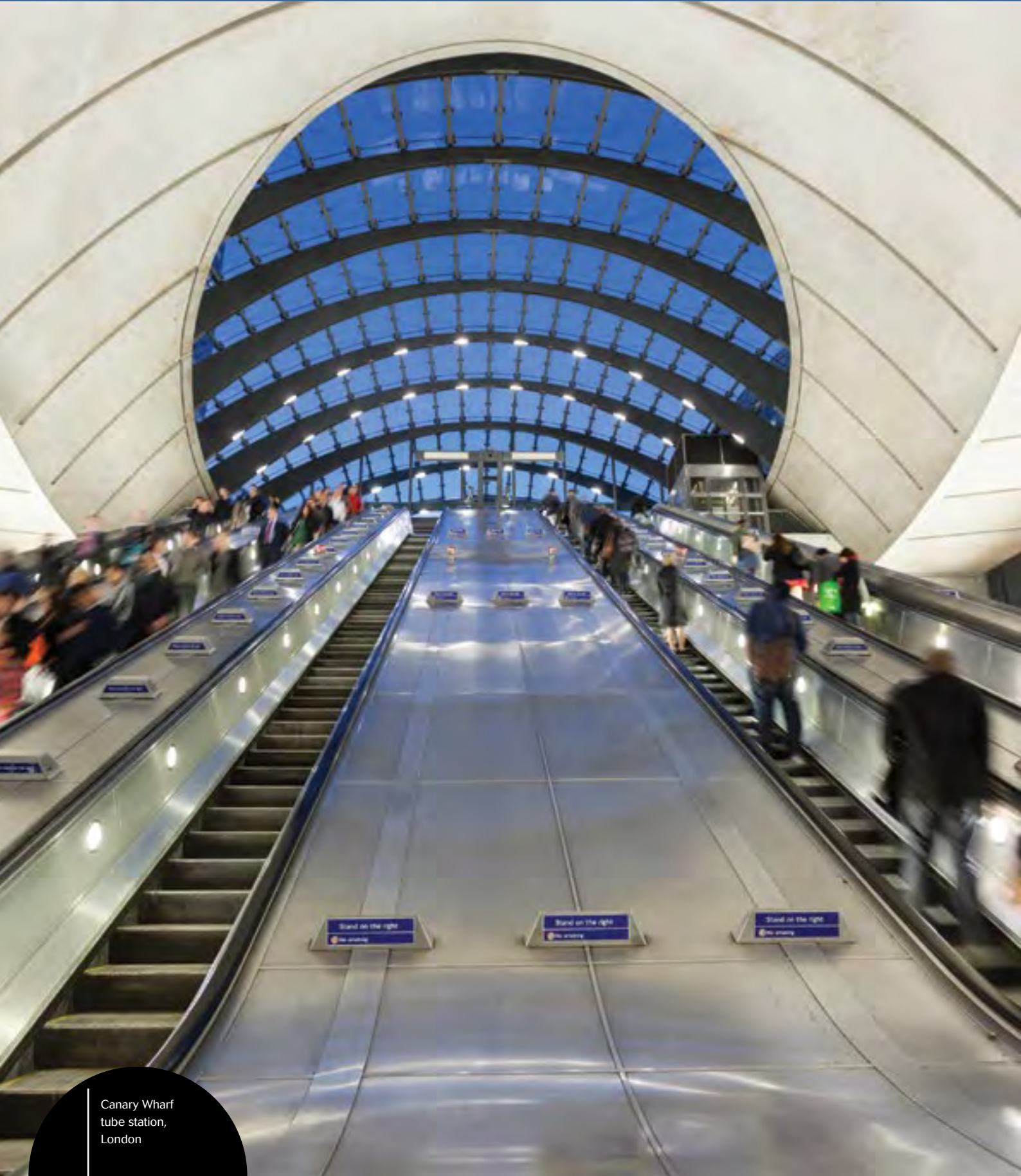
Canary Wharf tube station, London