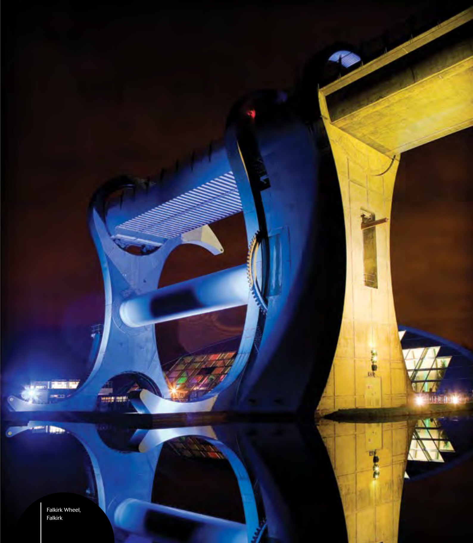
Falkirk Wheel, Falkirk