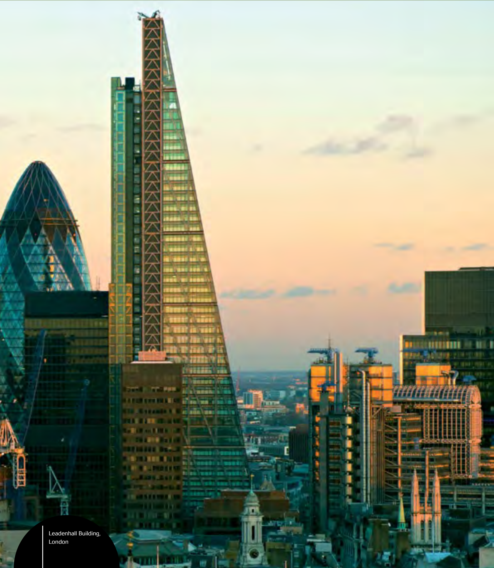
Leadenhall Building, London