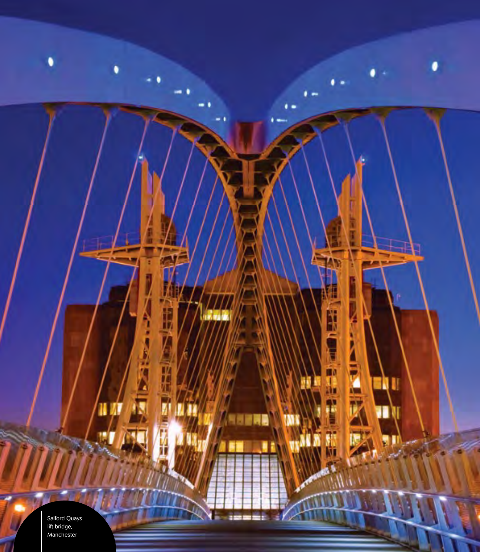
Salford Quays lift bridge, Manchester