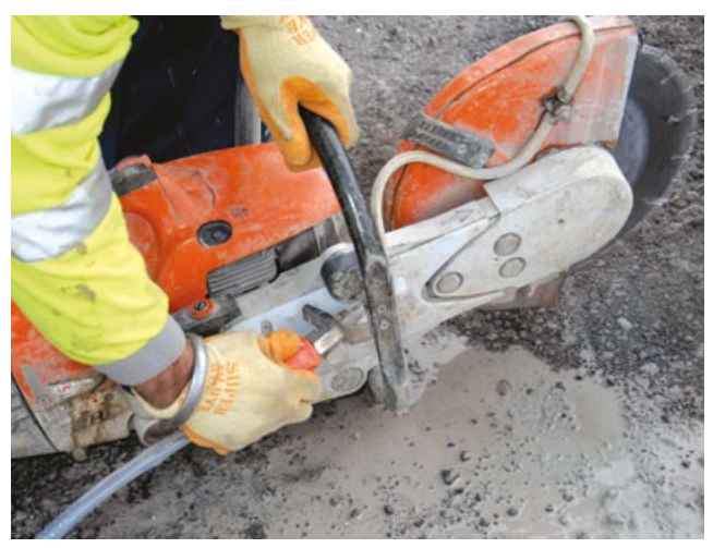
Figure 3 Water suppression on a cut-off saw

■ Water – water damps down dust clouds. However, it needs to be used correctly. This means enough water supplied at the right levels for the whole time that the work is being done. Just wetting the material beforehand does not work.