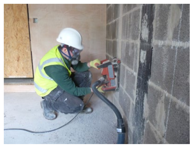
Figure 4 Wall chasing using on-tool extraction

■ On-tool extraction – removes dust as it is being produced. It is a type of local exhaust ventilation (LEV) system that fits directly onto the tool. This 'system' consists of several individual parts – the tool, capturing hood, extraction unit and tubing. Use an extraction unit to the correct specification (ie H (High) M (Medium) or L (Low) Class filter unit). Don't just use a general commercial vacuum.