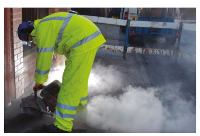
Figure 1 Common tasks like cutting can create very high dust levels

However, most of these diseases take a long time to develop. Dust can build up in the lungs and harm them gradually over time. The effects are often not immediately obvious. Unfortunately, by the time it is noticed the total damage done may already be serious and life changing. It may mean permanent disability and early death.